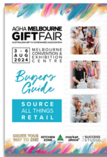
Buyers Guide example