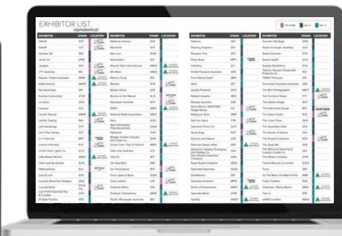
company listings example

Average marketing savings per exhibitor, per event: $770